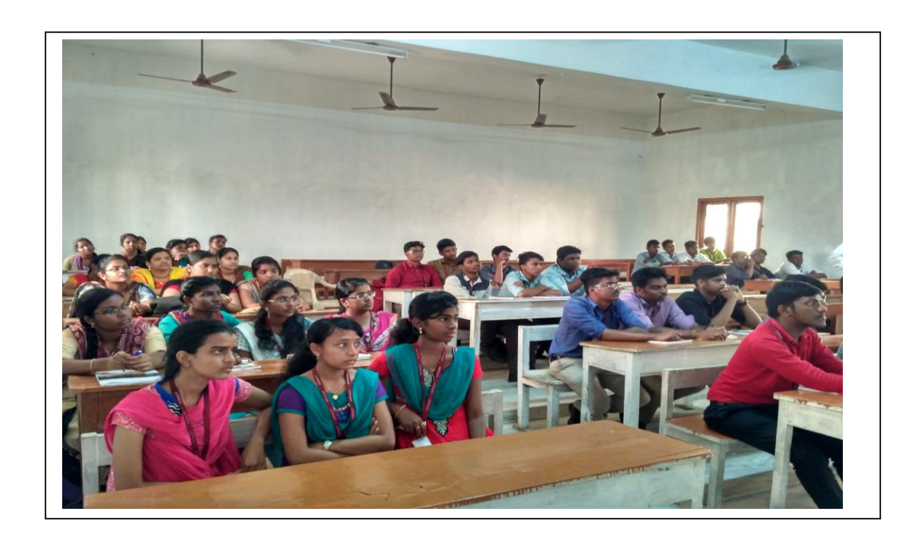
Students - listening the facilitator voice

This course helps the students to understand and take up the entrepreneurship. The E-cell students were participated many event like E-leader workshop, Enatra, etc.