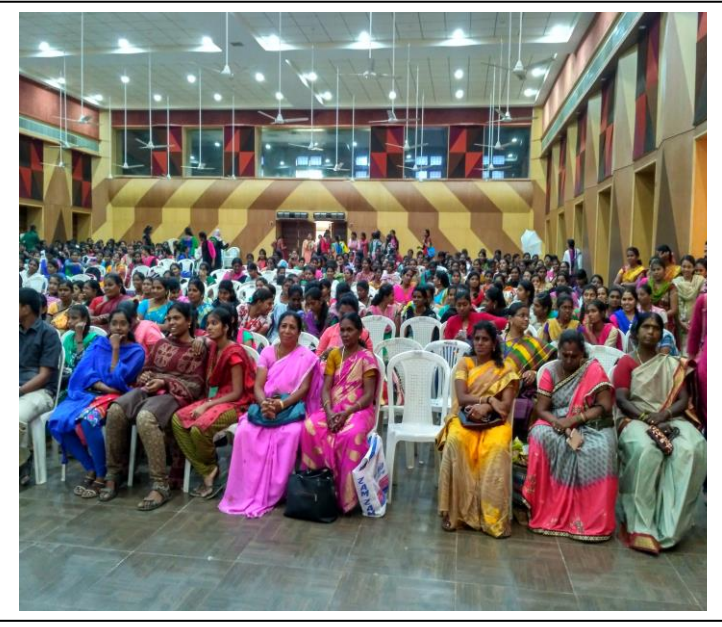
INTERNATIONAL WOMEN'S DAY CELEBRATION