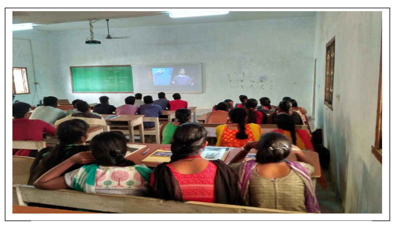
Students are watching the successful stories of Entrepreneurs