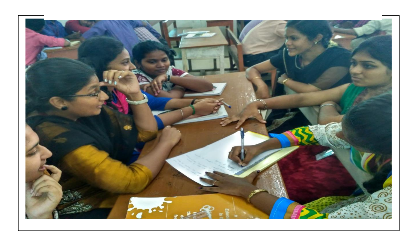
Discussion about the activity assigned