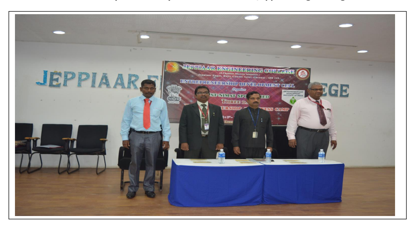
EAC Inauguration during prayer song