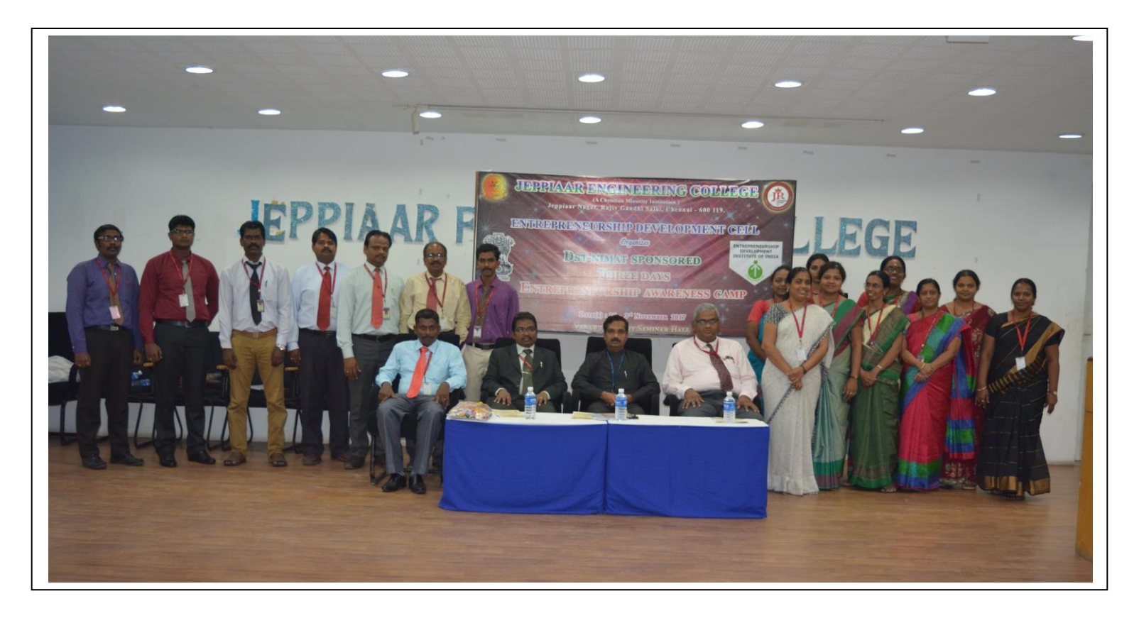
Head of the Departments at EAC