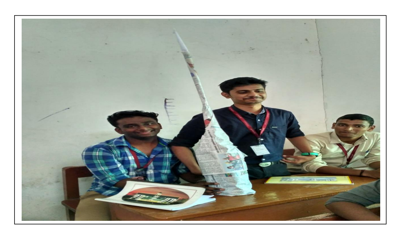
Conversion of IDEA into Prototype by using the waste news papers