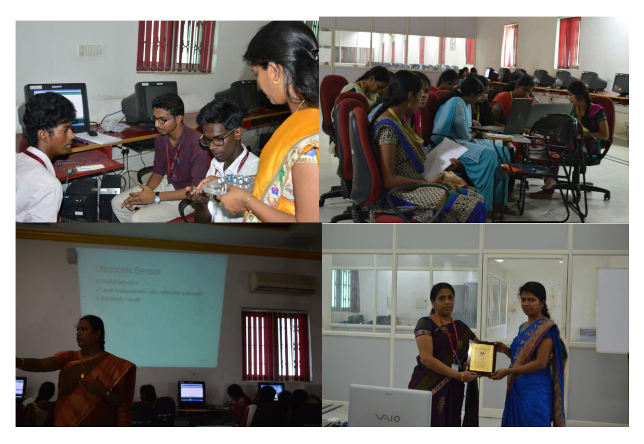
MOTIVATIONAL TALK SESSIOIN BY IEEE STUDENT CHAPTER

The IEEE student branch of Jeppiaar engineering college has started its events with a bang as it conducted an event "MOTIVATIONAL TALK" on 27<sup>th</sup> of June 2017, as the first event of this academic year which became a grand success. In IEEE the events are generally conducted by the IEEE members for the welfare of the students.